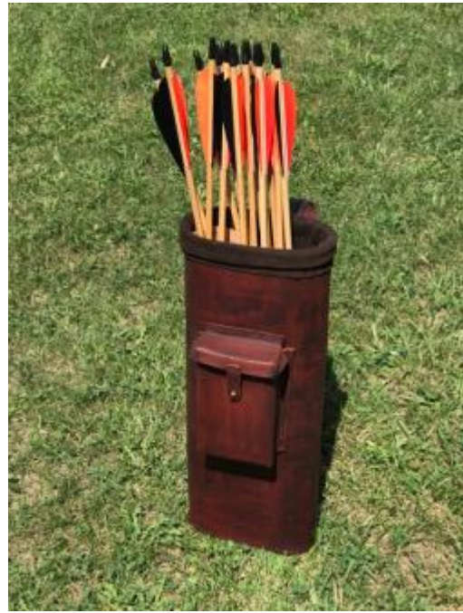
Quiver & Arrows, by Dietrich

making a traditional Long Bow. It is right for my persona and is, in theory, simpler to make than some of the other types of bows.