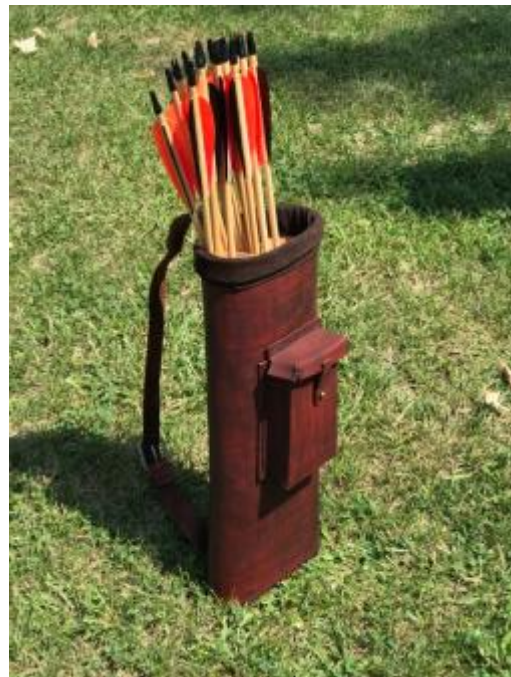
Quiver & Arrows, by Dietrich