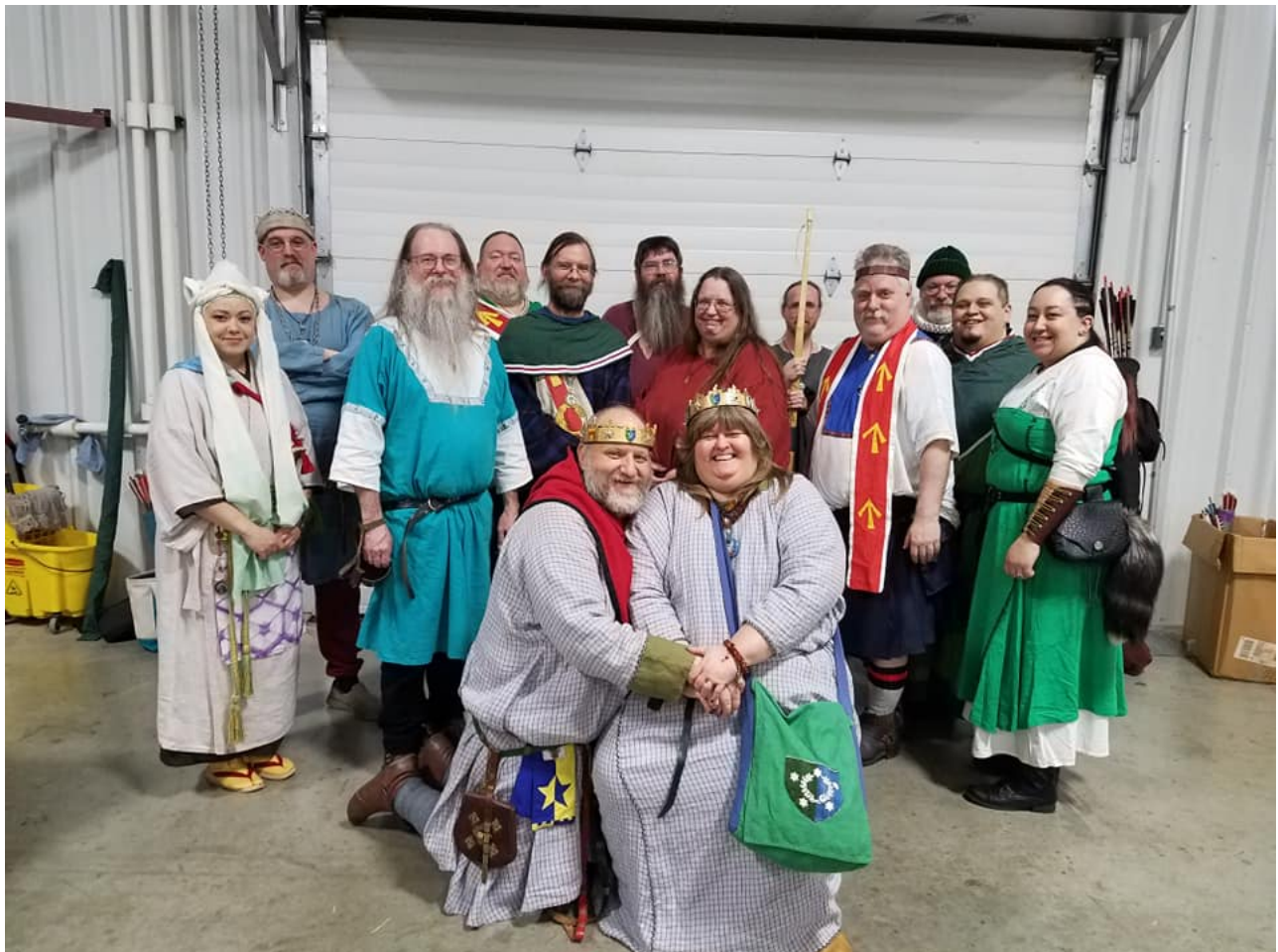
Ayreton at Better War Through Archery